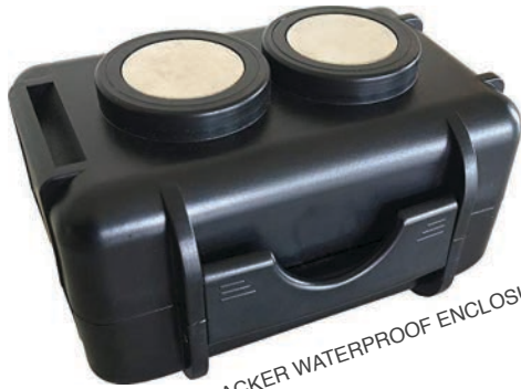
TYPICAL GPS TRACKER WATERPROOF ENCLOSURE