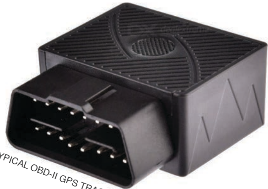
TYPICAL OBD-II GPS TRACKER

2. Visit a car dealership. For a moderate fee a service department tech can inspect the entire vehicle. The tech may not know exactly what to look for, but they will spot what doesn't belong there, quickly. Additionally, they have wiring schematics, and special tools to remove panels and headliners.