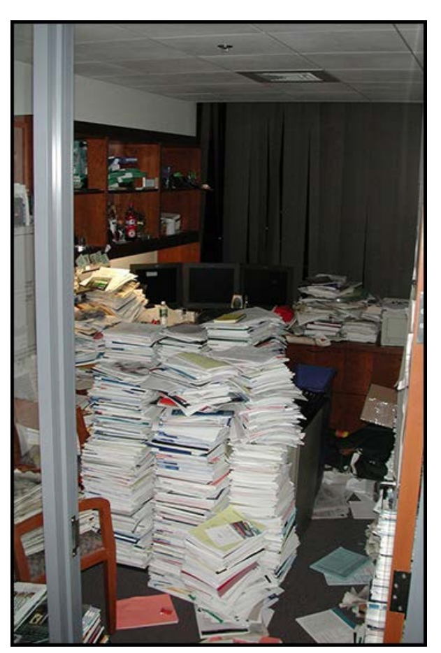
Unfortunately, not all paperwork is easy to secure.

Another important guideline is a secure key rule. Keys should not be stored in the same area as the locks they open, like the admin's desk drawer. Storage in a locked desk, or "a good hiding spot," is not acceptable either. Spies know about "good hiding spots" and how to pick open simple desk locks.