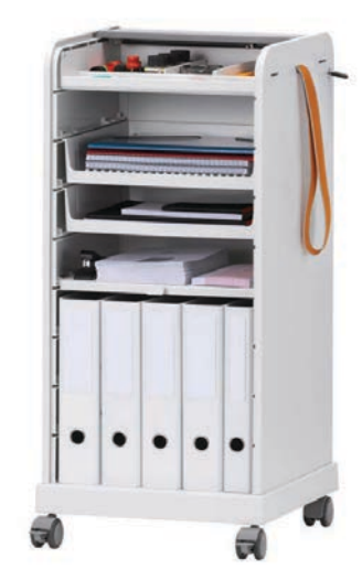
Follow Me 1 - $1,045.00