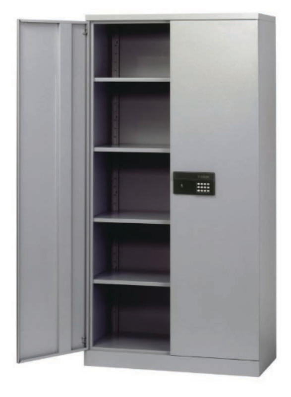
Edsal 36 in. Keyless Electronic Cabinet by Edsal $351.99