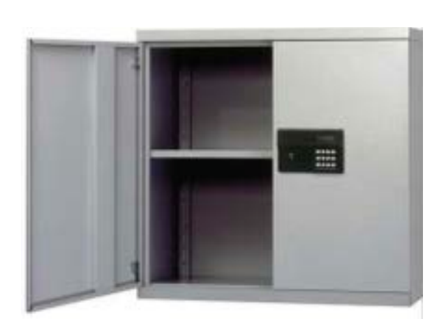
KDEW3012-05 Wall Mount Storage Cabinet by Edsal $140.71